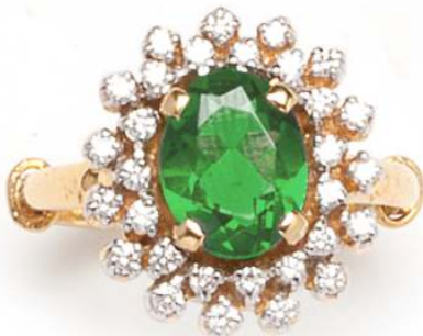
Designed by Sampat Jewellers Inc.

Greenery is a refreshing shade and a symbol of new beginnings. 2017 weddings will use a lot of greenery. This color represents flourishing foliage and encourages people to take a deep breath and reinvigorate. It's definitely a very refreshing color that one must consider while choosing fine jewelry pieces. Peridot gemstones and emeralds may be a great choice if looking for accent pieces. Give it a try, and these colors will not disappoint.