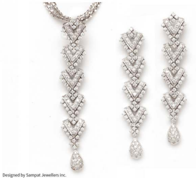
Designed by Sampat Jewellers Inc.