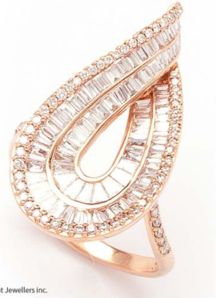
Designed by Sampat Jewellers Inc.

Baguette diamonds are linear rectangular shape diamonds with octagonal corners. The shape of the diamonds goes well with the Art Deco theme. The jewelry emphasizes pure geometric forms with clean lines. Baguette diamonds look fabulous when incorporated into jewelry. Below is an example of a gold and Art Deco style ring with baguette diamonds.