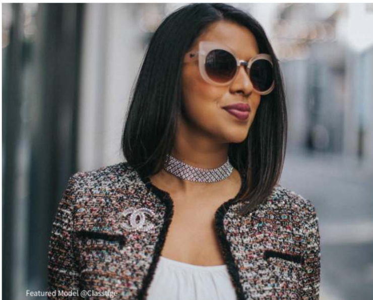
Featured Model @Classitge

In the picture below @Classitge is wearing a diamond choker that is looking fabulous. Its simple yet extremely sophisticated. You can dress this up with you bridal outfit or wear later for special occasions.